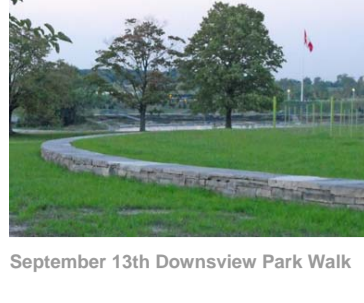
September 13th Downsview Park Walk