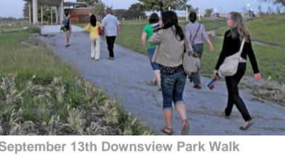
September 13th Downsview Park Walk